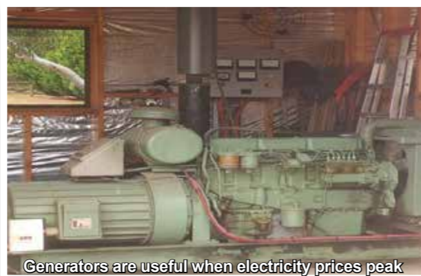
Generators are useful when electricity prices peak

Jump in quick to be one of the first 20 PCA members to get the initial comprehensive comparative report, for free.