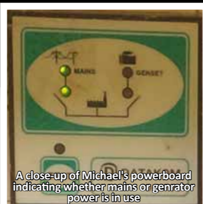
A close-up of Michael's powerboard indicating whether mains or generator power is in use

They do the hard work for you, identifying the best offer for your business regardless of the complexity of supply available.