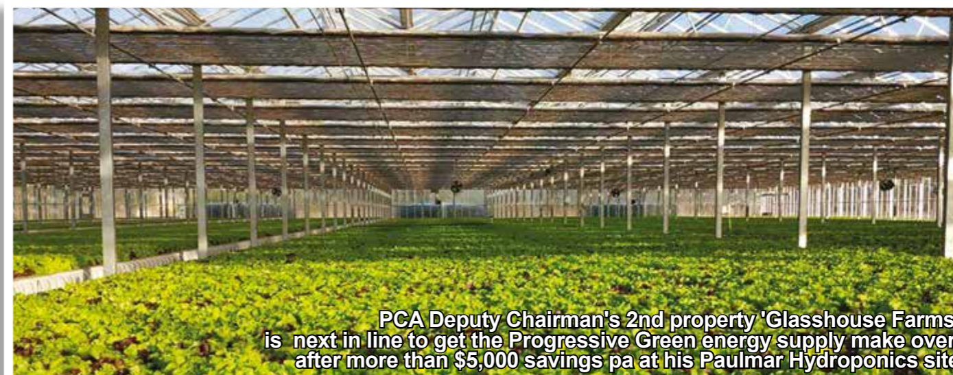
PCA Deputy Chairman's 2nd property 'Glasshouse Farms' is next in line to get the Progressive Green energy supply make over, after more than $5,000 savings pa at his Paulmar Hydroponics site

This is called 'Wholesale Pool Purchasing' and he gets lots of text prompts and the system works very smoothly.